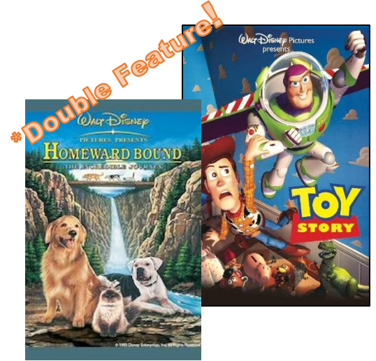
Toy Story – 6pm Homeward Bound – 7:30pm Tuesday, July 23 rd