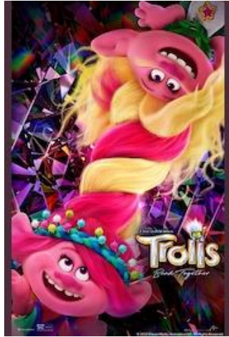
Trolls Band Together Tuesday, June 25th *Movie begins at 6:00pm