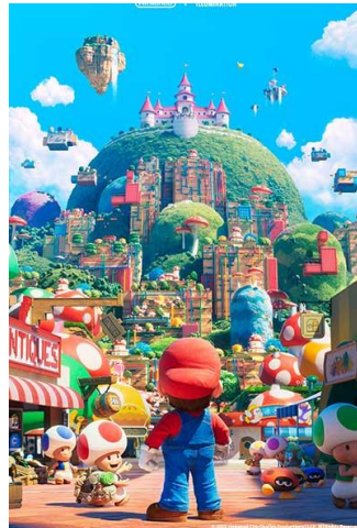
Super Mario Bros Tuesday, July 16 th Movie begins at Dark Family Night at Library Field