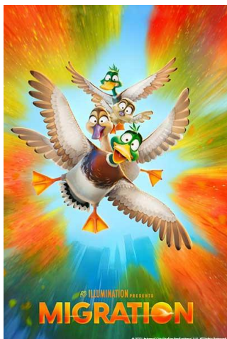
Migration Tuesday, August 6th Movie begins at dark