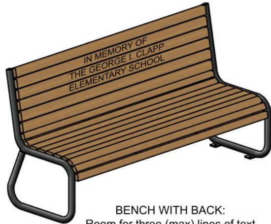
BENCH WITH BACK: Room for three (max) lines of text Letters approx. 2" tall